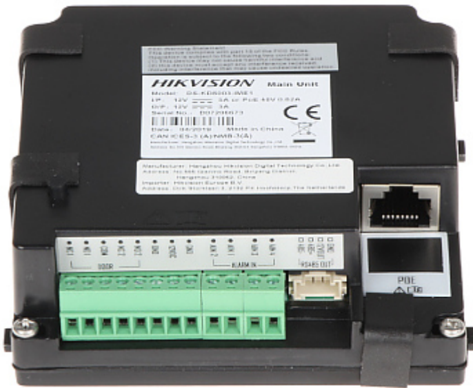
Device taken out from the housing: