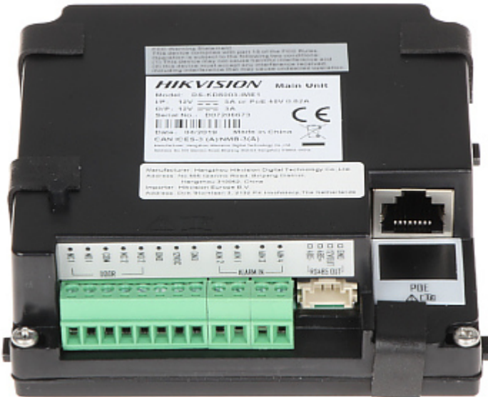
Device taken out from the housing: