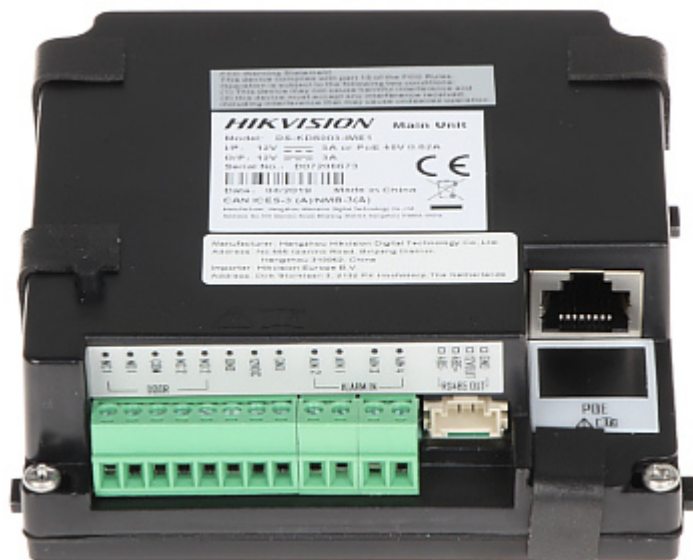
Device taken out from the housing: