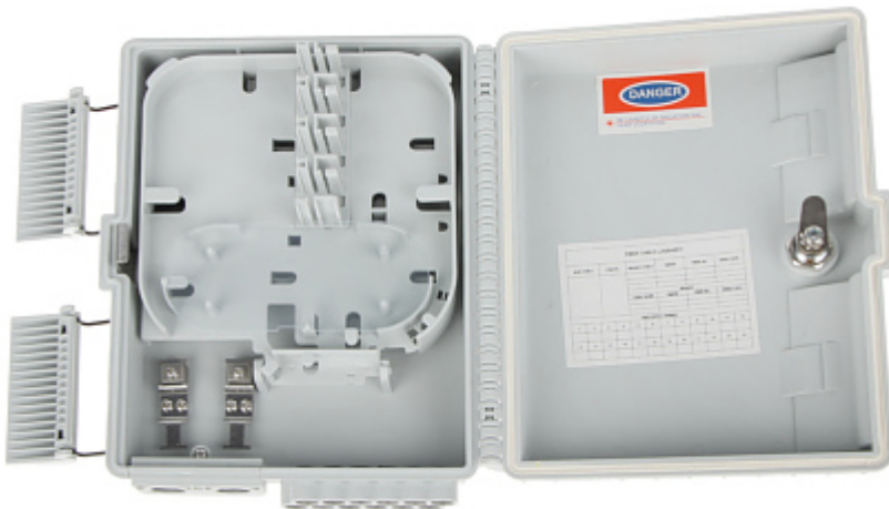
Internal view of the housing