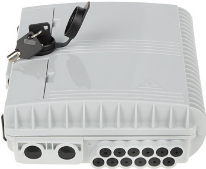
Mounting side view