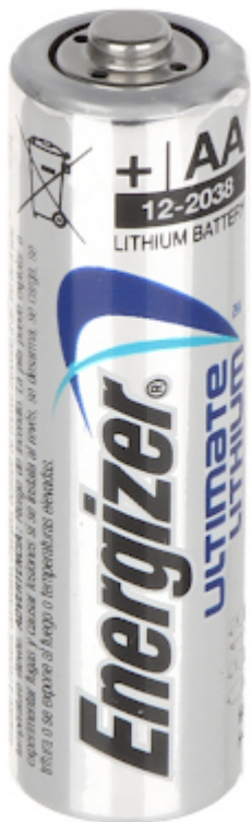
Comparison of Lithium and Alkaline batteries capacity: