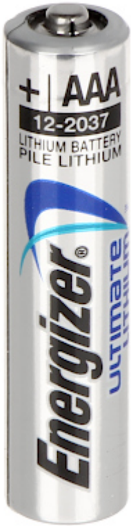
Comparison of Lithium and Alkaline batteries capacity: