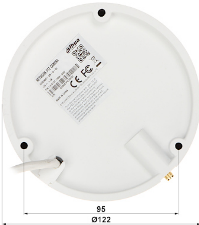
Camera mounting dimensions