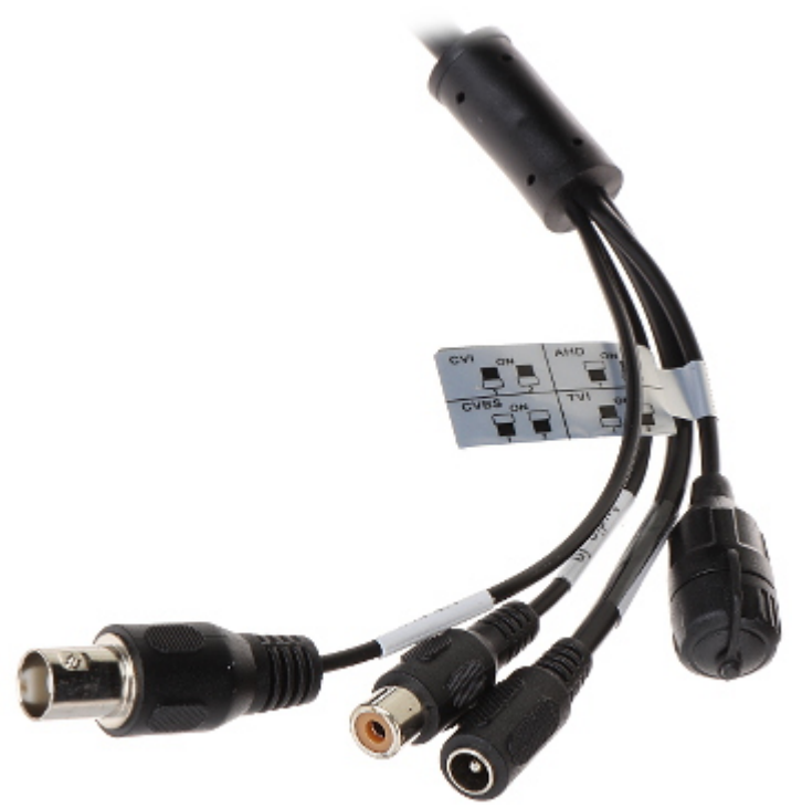
Standard changes are made using configuration switches: