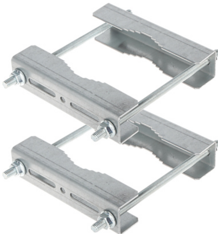
Clamp with reinforced profile. It enables mounting camera bracket to a pole.

The device must be secured against contact with caustic, staining and viscous fluids.