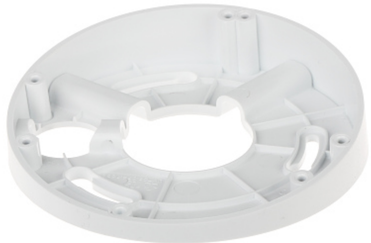
Ceiling bracket for cameras. Designed to dome cameras.

The device must be secured against contact with caustic, staining and viscous fluids.