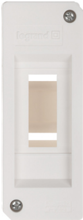
Internal view of the housing