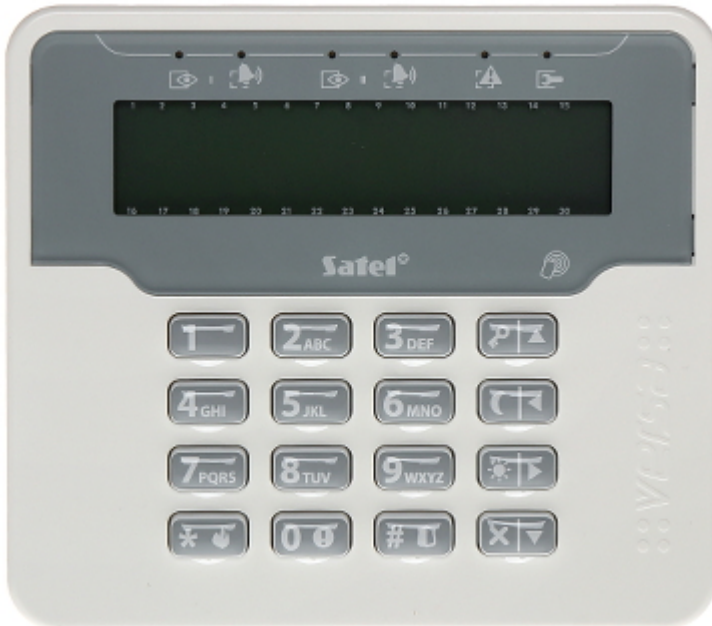
View after remove the cover: