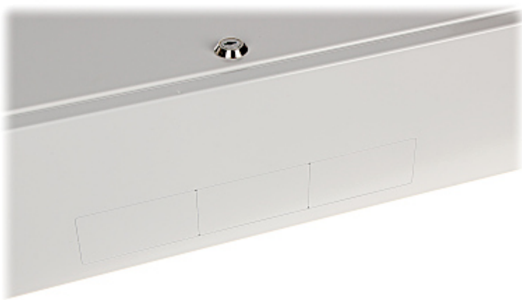
Holes for fan coolers: