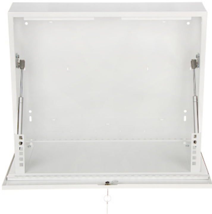
RACK 19" mounting rails: