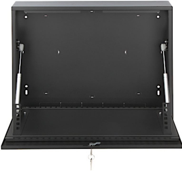
RACK 19" mounting rails