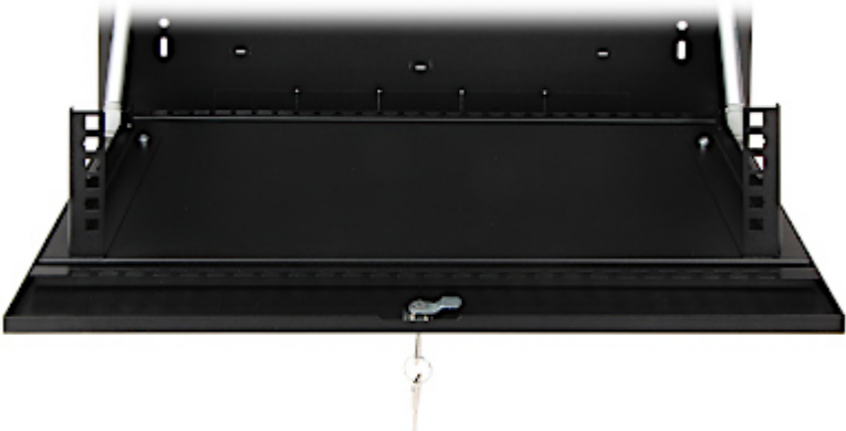
Mounting side view