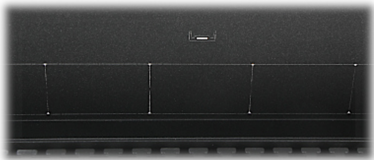
Holes for fan coolers