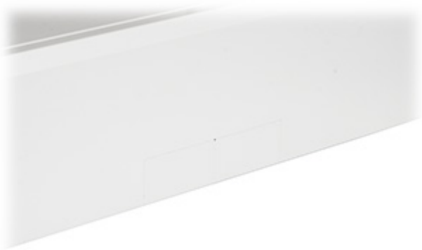
Holes for fan coolers: