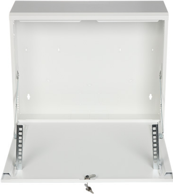
RACK 19" mounting rails: