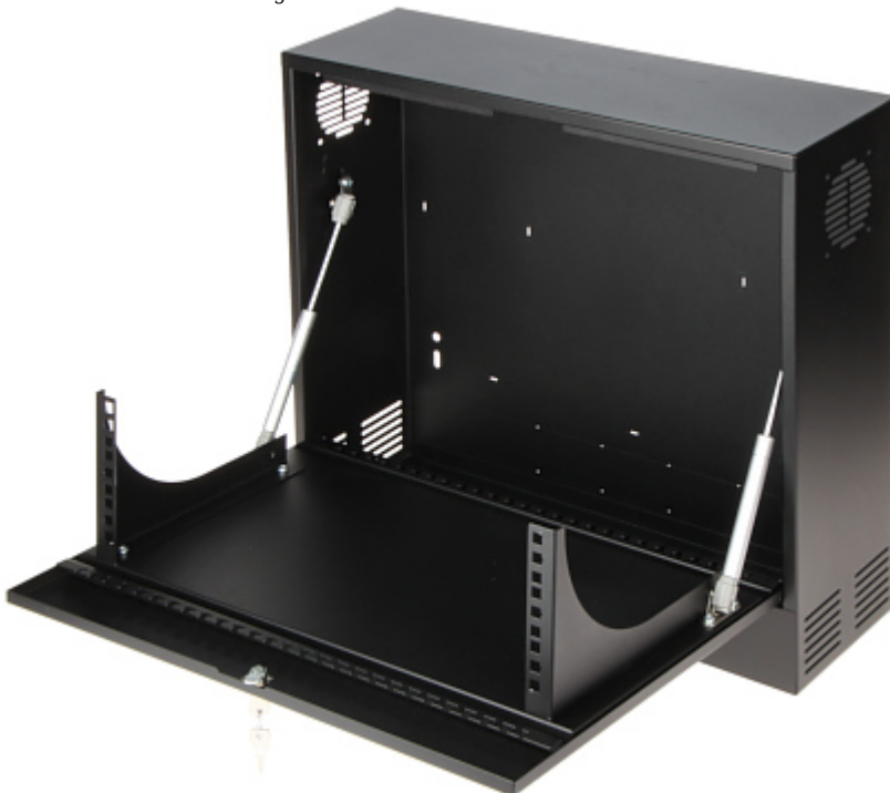
Internal view of the housing