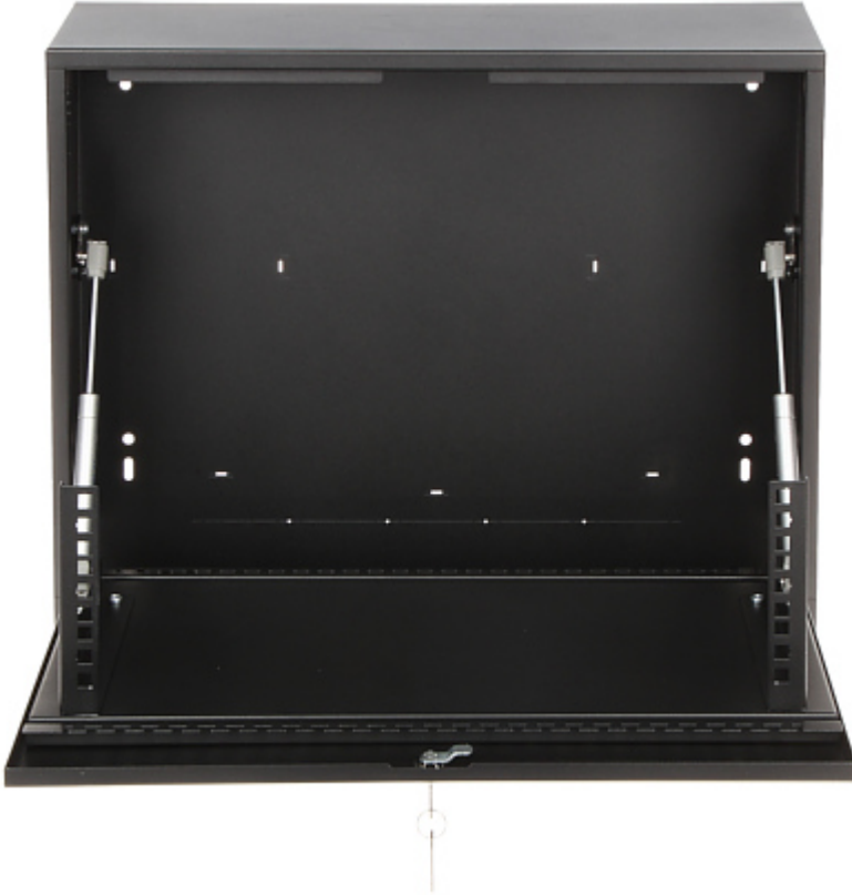
RACK 19" mounting rails