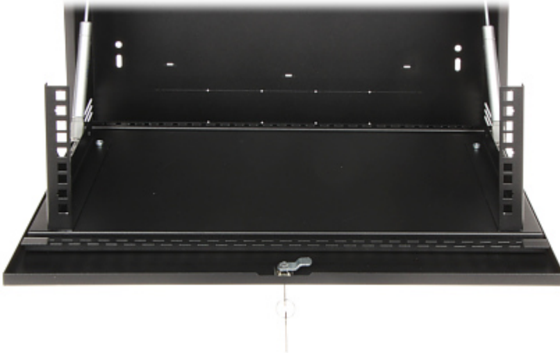
Mounting side view