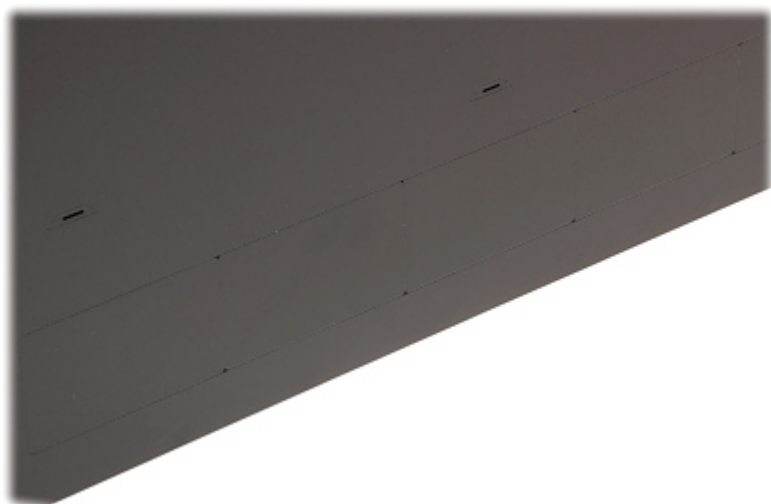
Holes for fan coolers: