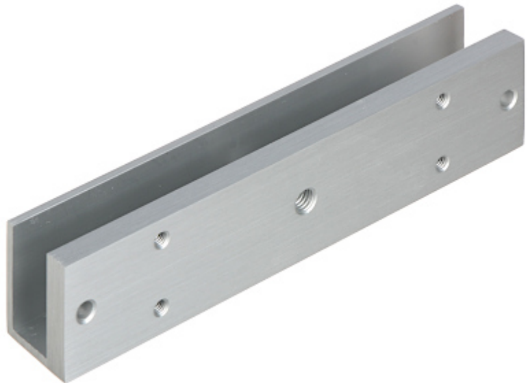
U-type mounting bracket for glass doors.

The device must be secured against contact with caustic, staining and viscous fluids.