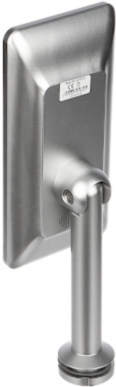
Mounting side view