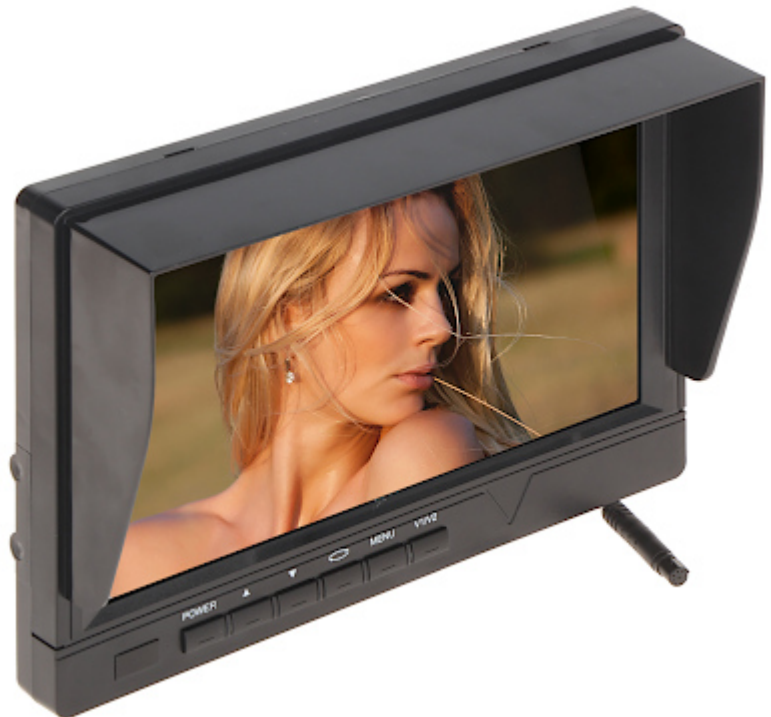
Car monitor with 9" screen diagonal with the possibility of connecting 2 video sources, e.g. mobile recorder.

The device must be secured against contact with caustic, staining and viscous fluids.