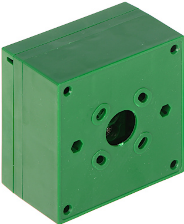
View after open the front cover: