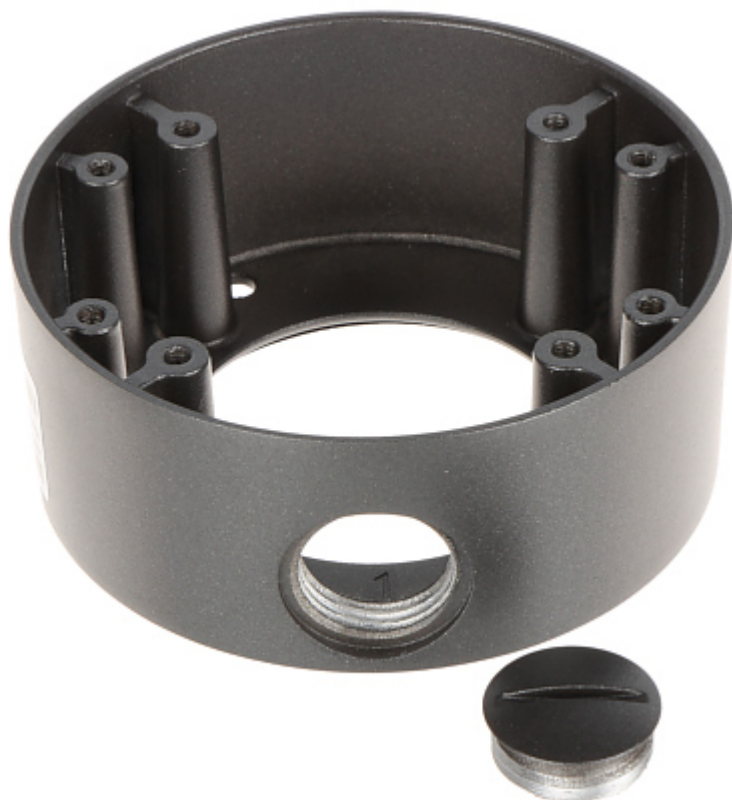
Camera mounting side view: