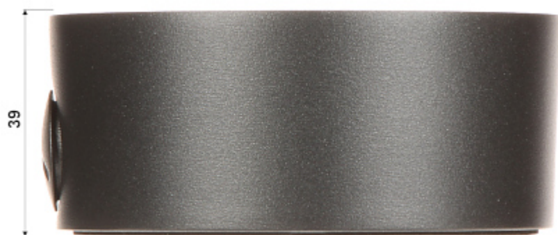
In the kit: