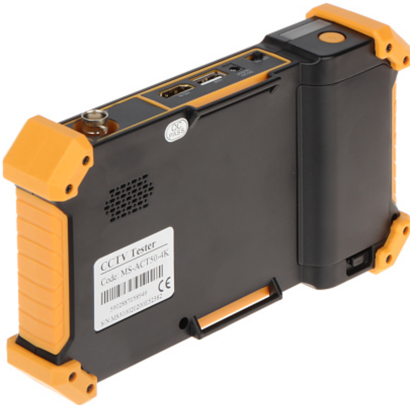
Place for battery: