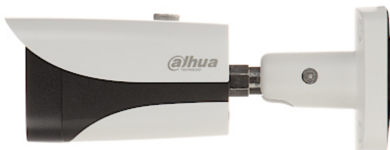
Memory card slot: