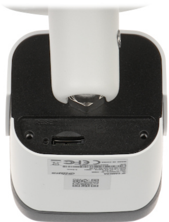
Camera mounting side view: