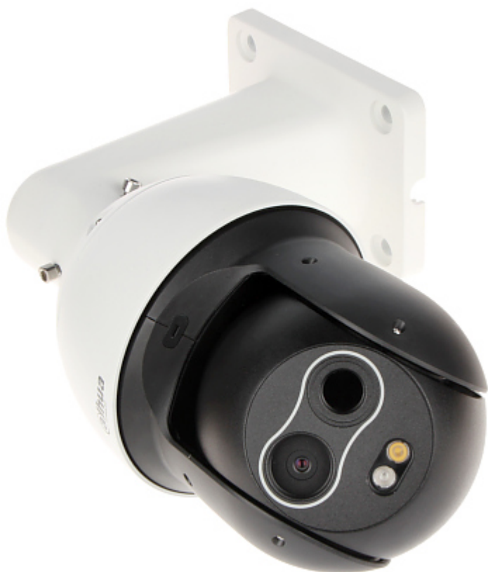
Memory card slot: