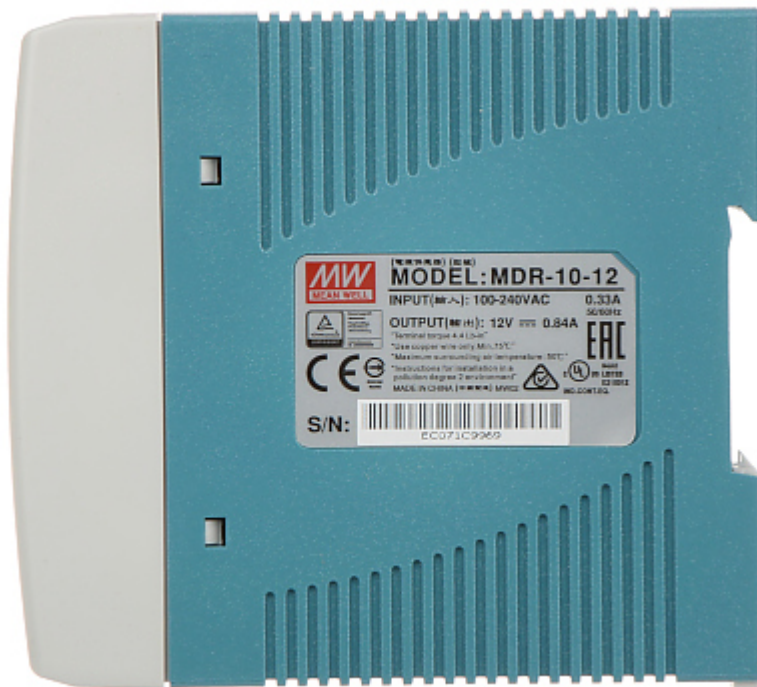
Rear panel (DIN rail installation):