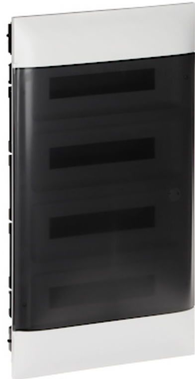
4-row 72-modular flush-mounting distribution electric cabinet.

The device must be secured against contact with caustic, staining and viscous fluids.