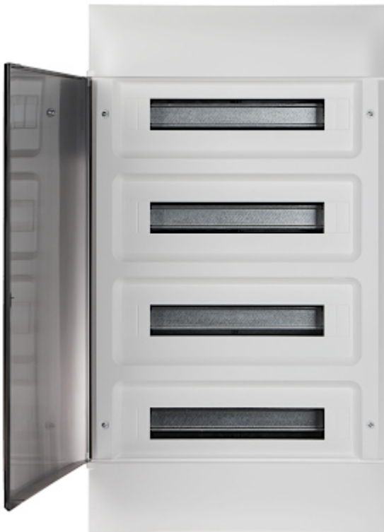
Internal view of the housing