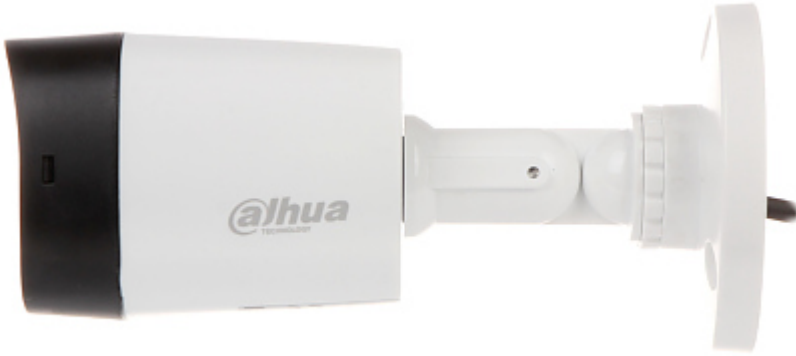
Camera mounting side view