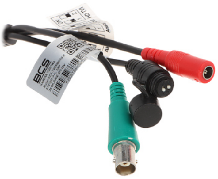
Standard changes are made using configuration switches: