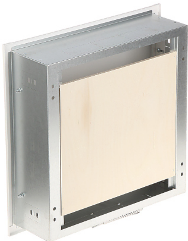
Cable entries broken off: