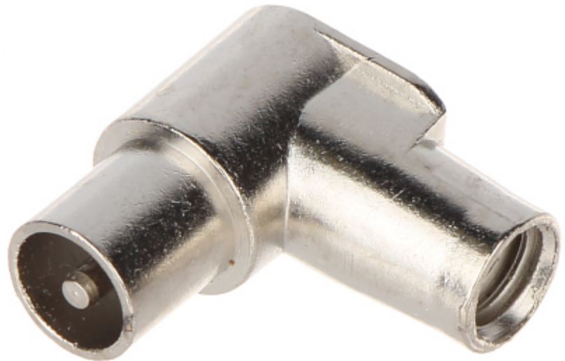
IEC plug, clamped on coaxial cable.

The device must be secured against contact with caustic, staining and viscous fluids.