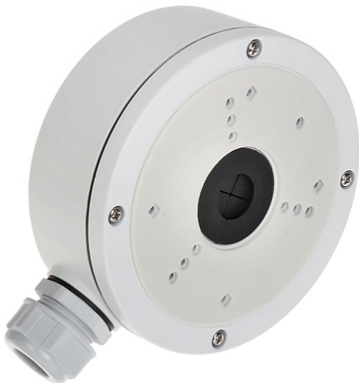
View of the ceiling mounting side: