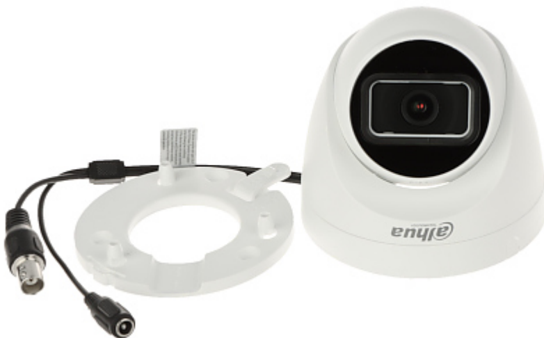
Mounting side view