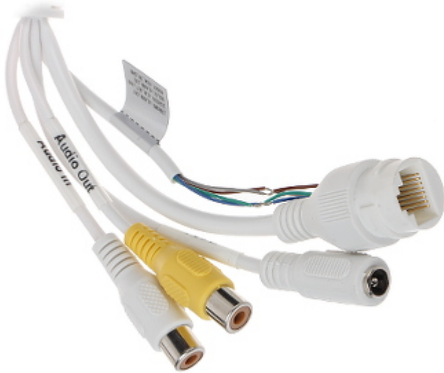
Camera mounting side view: