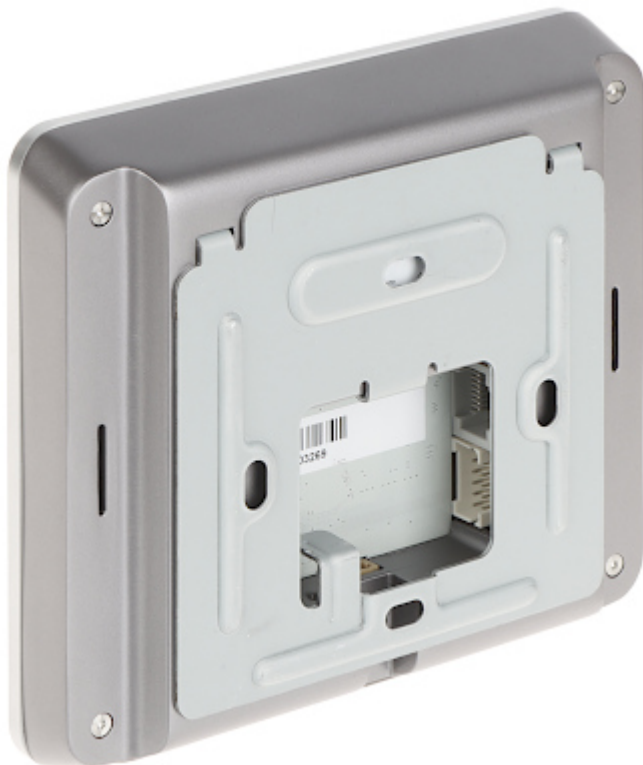
Rear view with desk stand attached: