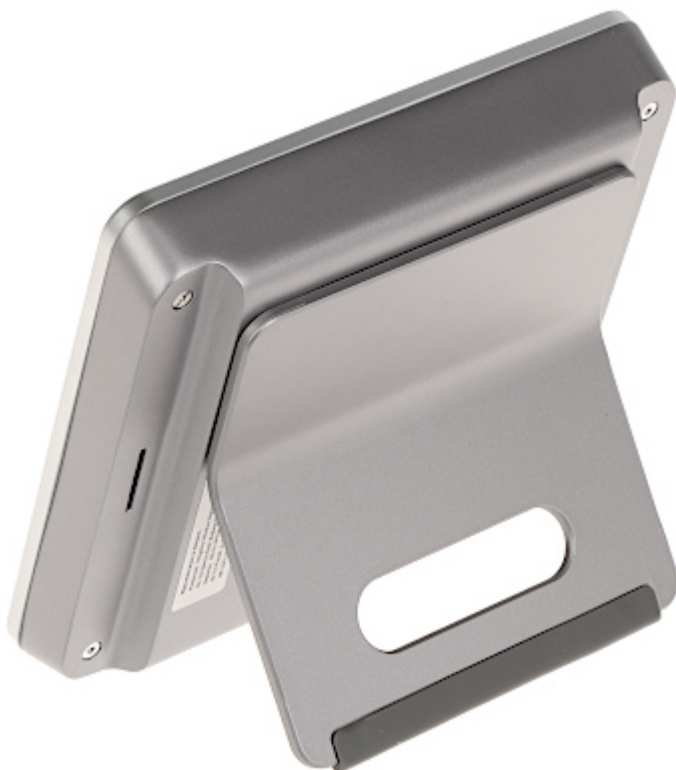
In the kit: