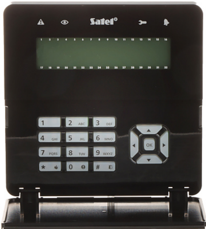
View after remove the cover: