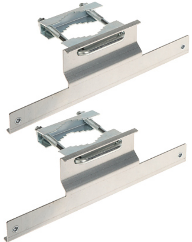
Pole mount for hermetic enclosures, enabling their assembly on poles.

The device must be secured against contact with caustic, staining and viscous fluids.