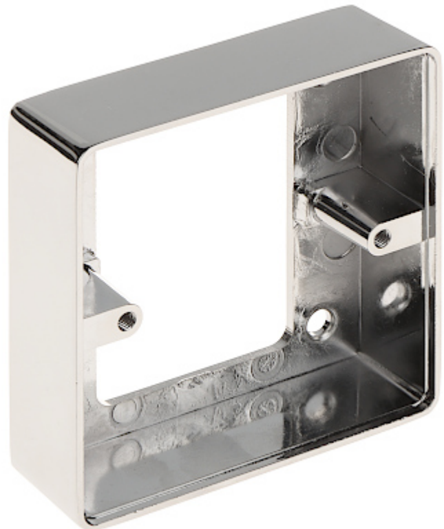
Surface-mounted box dedicated to mounting ATLO door opening buttons.

The device must be secured against contact with caustic, staining and viscous fluids.