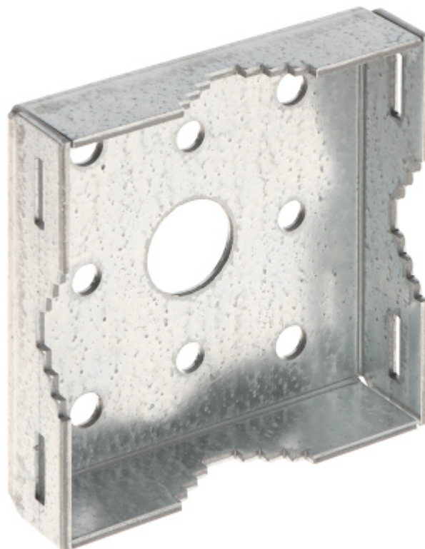
Universal mounting element for mast.

The device must be secured against contact with caustic, staining and viscous fluids.