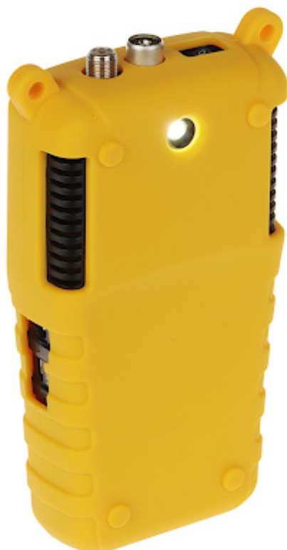
Place for battery: