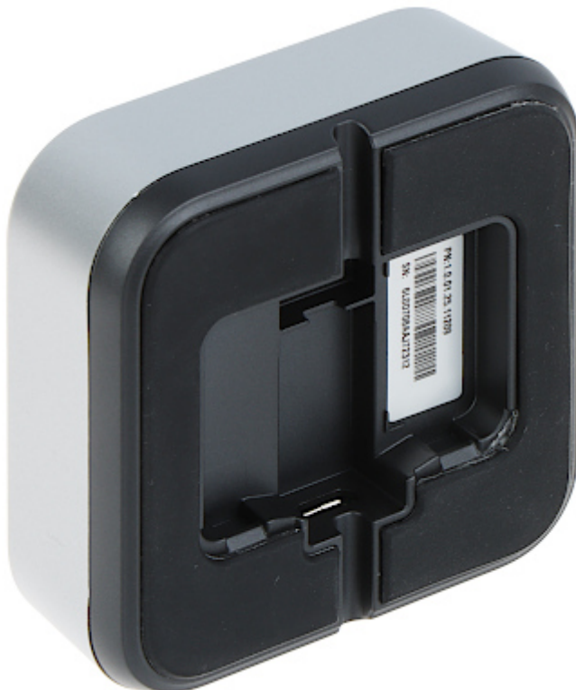
micro USB connector: