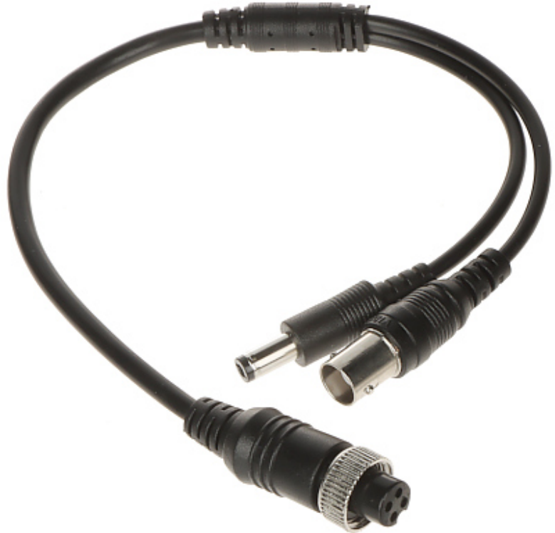
Connection cable terminated with M12 4-pin plug on one side and BNC plug and 2.1/5.5mm power plug on the other.

The device must be secured against contact with caustic, staining and viscous fluids.