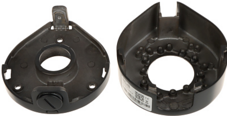
Wall mounting side view: