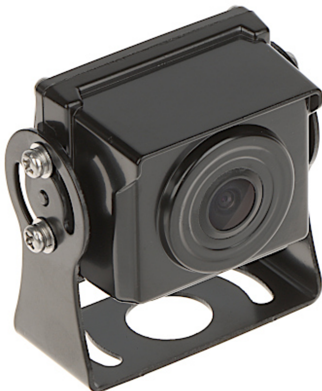
Small dimensions camera: