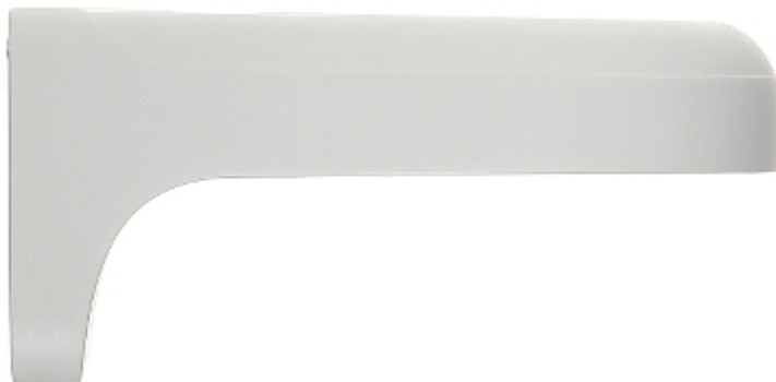
Wall mounting side view: