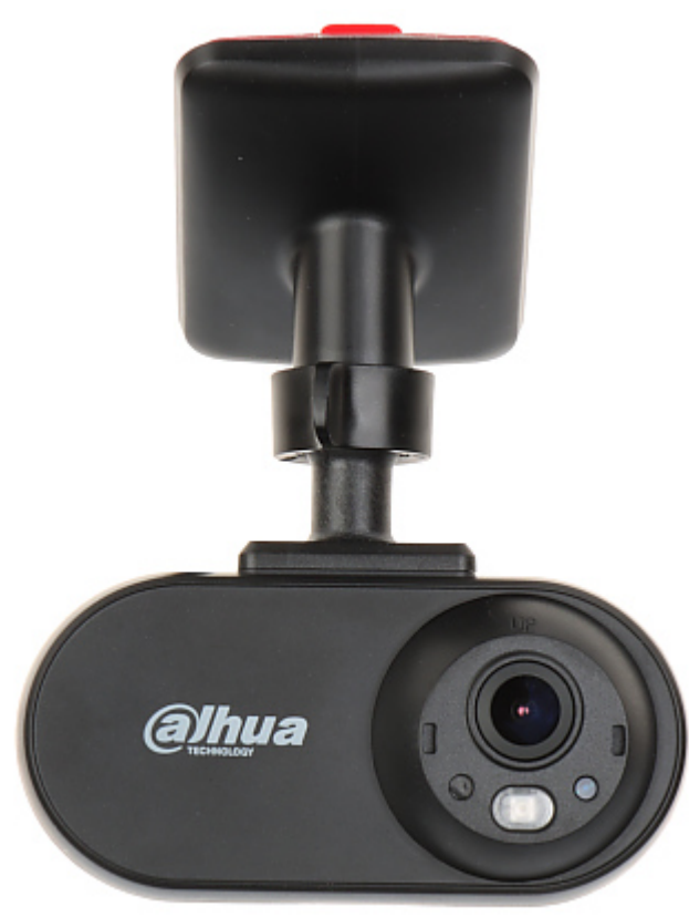
Front / rear view camera:

Code: HAC-HMW3200L-FR-0210B-S5\\ AHD, CVI, TVI, CVBS MOBILE CAMERA \\ \textbf{HAC-HMW3200L-FR-0210B-S5} - 1080p \ 2.1 \ mm, \ 2.8 \ mm\\ DAHUA