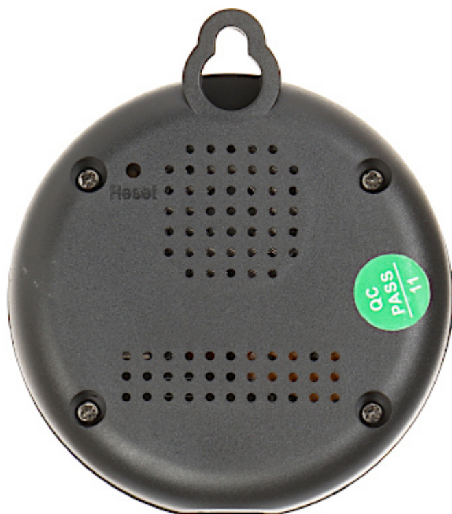
Bottom view (power socket):