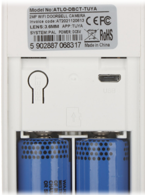
Wireless doorbell: Rear view: