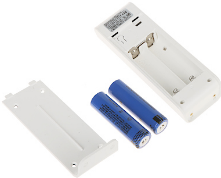
Memory card slot, micro USB and "Reset" button: