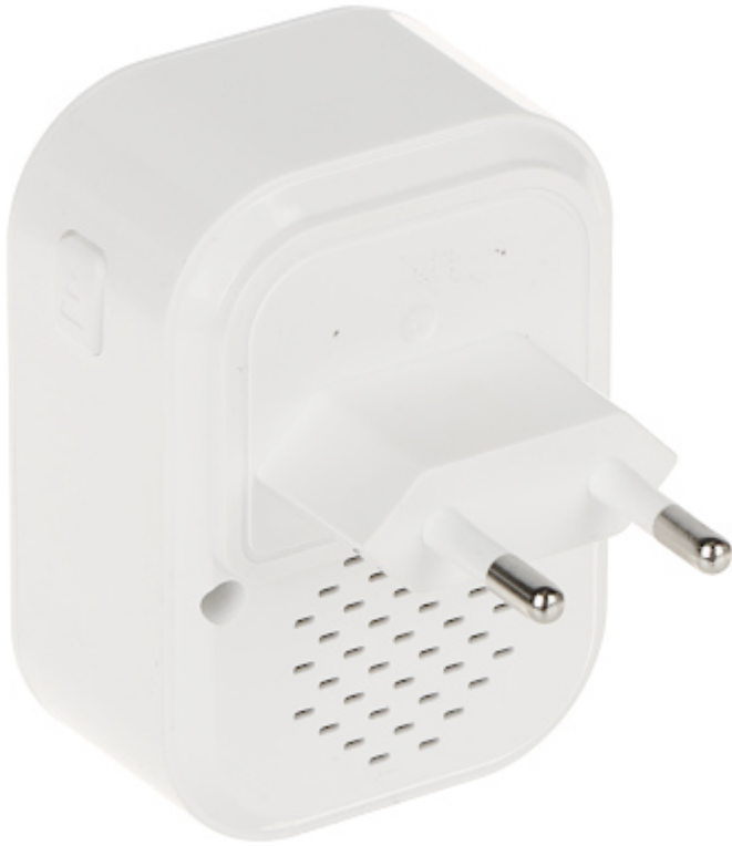
View of the sides of the device (visible control buttons):