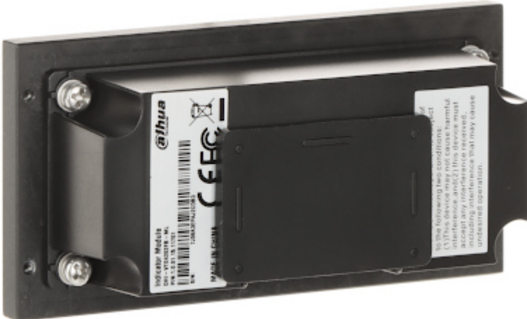
Internal view of the housing