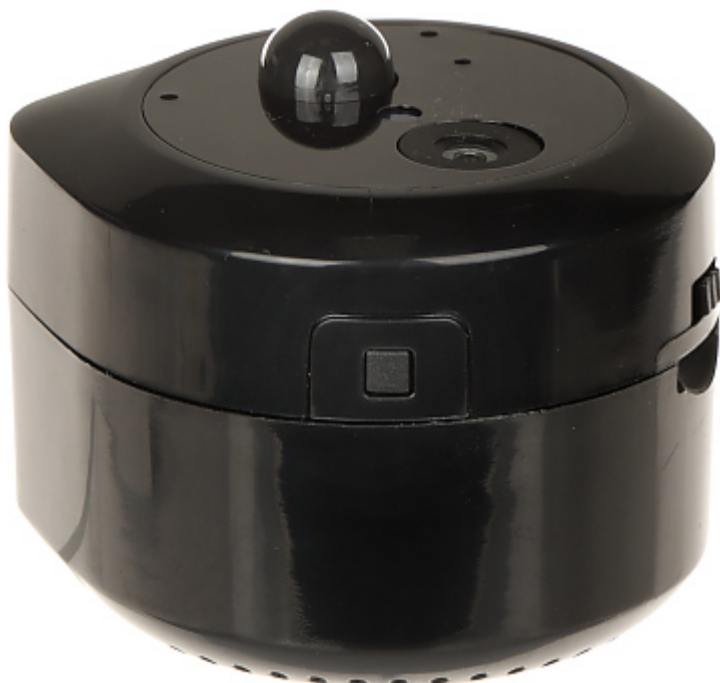
micro USB connector: