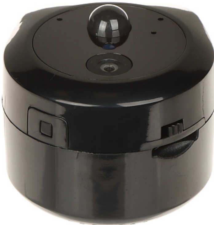
The microSD socket and camera switch