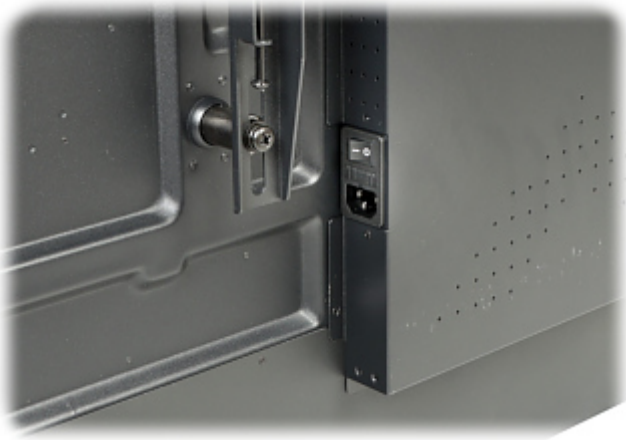
Place for the stylus pen