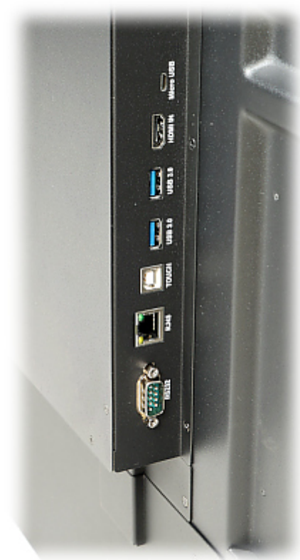
Optional PC module connector: