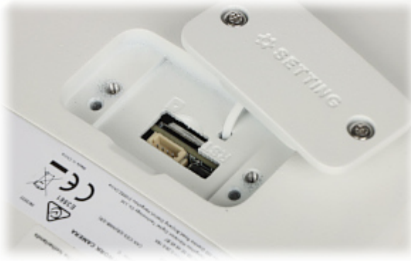
Mounting side view